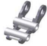
Type B - rol

Ketting geproduceerd door een ISO 9001 - ISO 14001 & API 7F gecertificeerd bedrijf. Voorgerekte kettingen (30%). Verpakt per 5 meter.